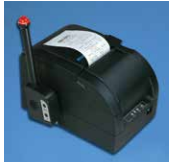
Optional Audio/Visual Print Messenger