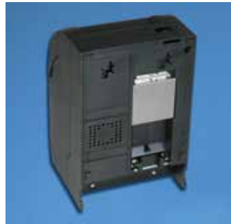
Built-In Wall Mount Capability