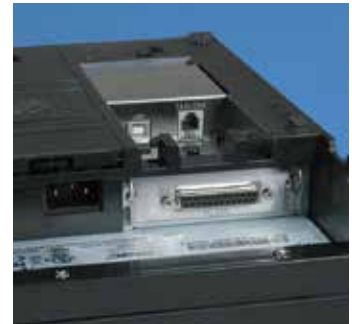
Concealed, Yet Easy to Access Power Supply – Dual Interface Boards Allow a Variety of Configurations