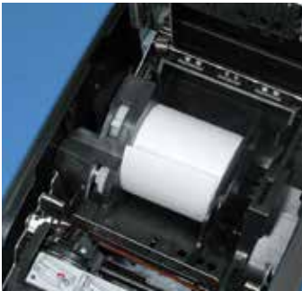
Drop and Print Paper Loading with Built-In Paper Width Selector